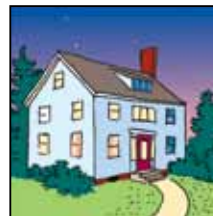
... or home