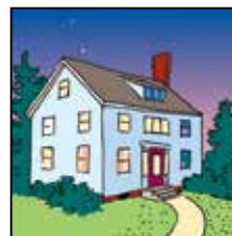
... or home