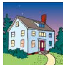
... or home