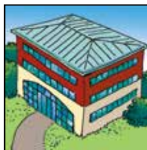
At your office ...

PROS: subject matter immersion; professional networking opportunities; faculty interaction.